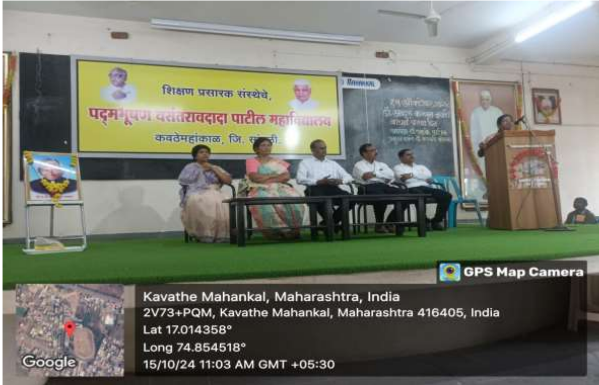
Photo of the Activity